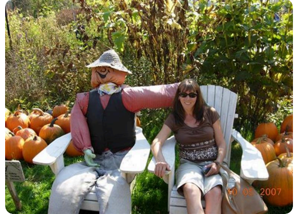
Scarecrow and Laura